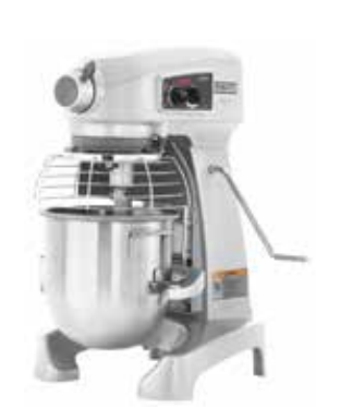
Model HL200 20 I bowl capacity