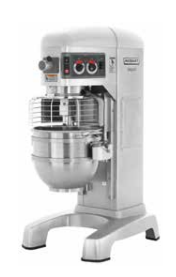
Model HL600 60 I bowl capacity