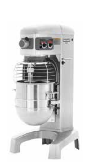
Model HL400 40 I bowl capacity