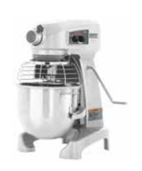
Model HL120 12 I bowl capacity