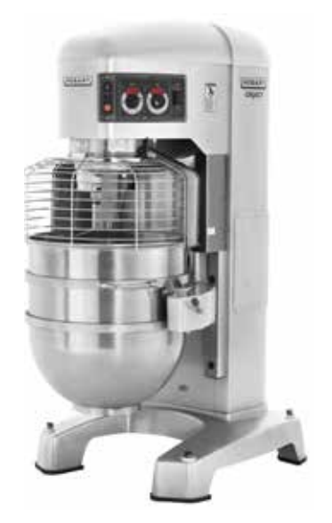
Model HL1400 140 I bowl capacity