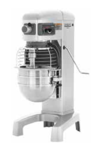
Model HL300 30 I bowl capacity