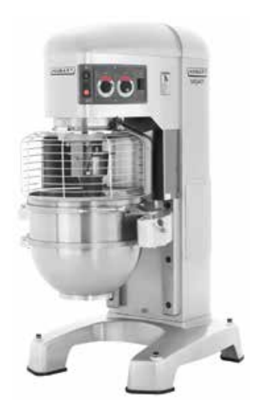
Model HL800 80 I bowl capacity